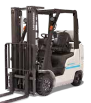
Platinum II<sup>®</sup> Series Cushion Tire Models LPG / Dual Fuel

Load Capacity (lbs): 3,000 / 3,500 / 4,000<sup>†</sup> / 5,000 5,500 / 6,000 / 7,000