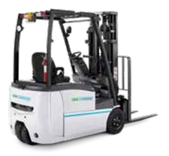
TX-M 3-Wheel Series Cushion Tire Models 36V / 48V

MXS - 4 Wheel Series Solid Pheumatic Models 48 Volt AC-Powered Load Capacity (lbs): 3,000 / 3,500 / 4,000