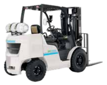
PF(D)80-PF(D)120 Series Pneumatic Tire Models LPG / Dual Fuel / Diesel* Load Capacity (Ibs): 8,000 – 12,000

Load Capacity (lbs): 4,000 / 5,000 / 6,000 / 7,000